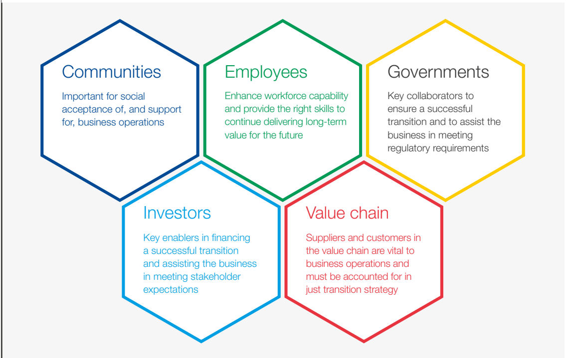
FIGURE 2 Stakeholders in the just transition