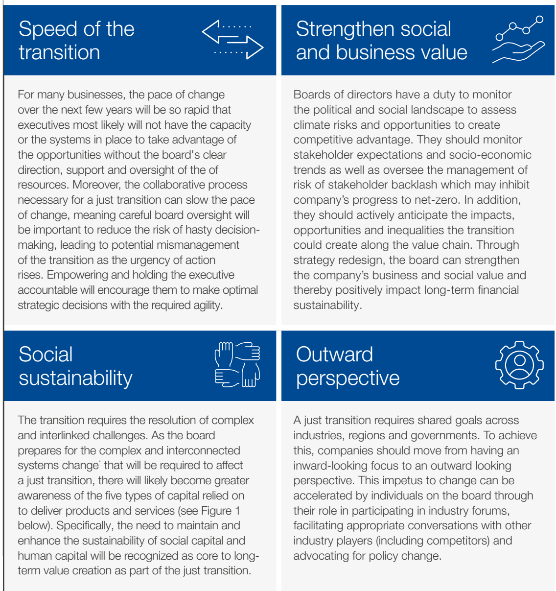
FIGURE 1 Chairperson's unique role in realizing value through a just transition

Boards of directors are critical to achieving an effective just transition that will benefit their business for four main reasons: