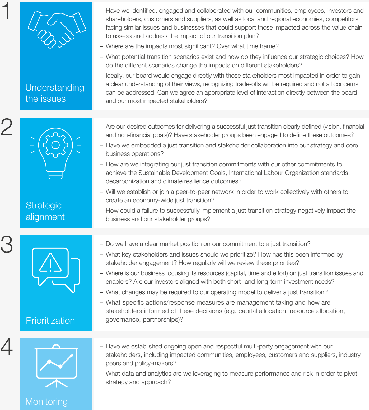
FIGURE 2 Key questions to navigate a just transition

boardroom. Below are key questions for board members to ask their CEO and executives in relation to the just transition. 17