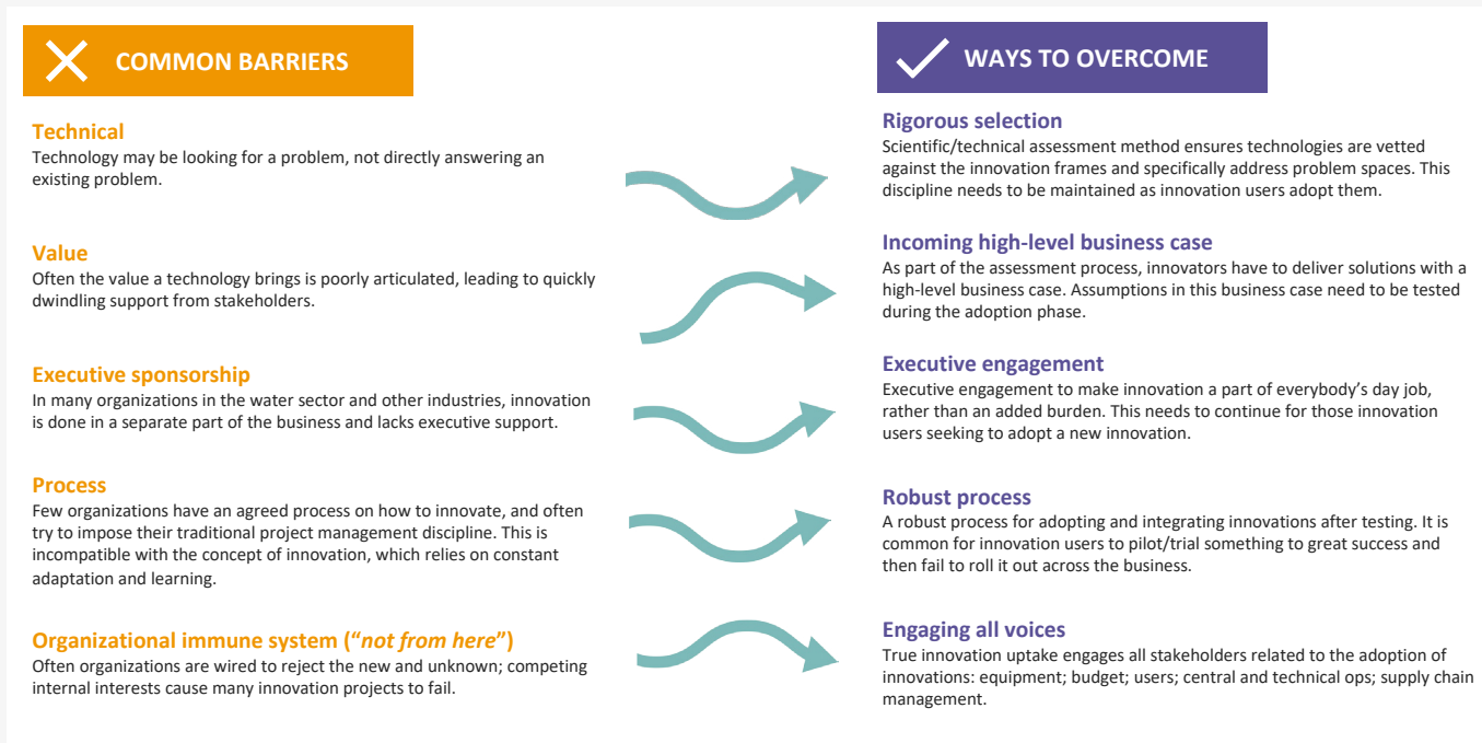
FIGURE 1 Overcoming barriers to innovation

In addition to those listed above, insufficient capital is the most common barrier technology developers cite to market entry and widespread uptake of their innovations. In fact, 38% of technology startups