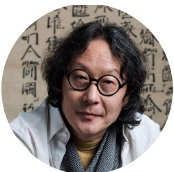
Xu Bing , People's Republic of China

Xu Bing is an artist, achieving international recognition for his mastery in printmaking. Focusing on the transmission of knowledge through language and cross-communication, his current work explores the impact of modern technology on the environment and human psyche. A past recipient of the MacArthur Fellowship, Xu's work has been exhibited in prestigious venues worldwide, including the International Venice Biennale. He currently teaches at Cornell University and at the Central Academy of Fine Arts in Beijing.