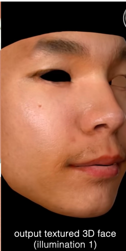
output textured 3D face (illumination 1)