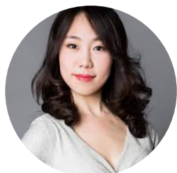
Hao Jingfang , People's Republic of China

Hao Jingfang is a Chinese science fiction writer and the first woman to receive the Hugo Award for Best Novelette for Folding Beijing . She also works as a macroeconomics researcher at the China Development Research Foundation, focusing on the role of artificial intelligence for policy-makers, and runs a start-up in the field of education in China. Hao is a Young Global Leader of the World Economic Forum.