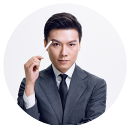
Chen Qiufan , People's Republic of China

Chen Qiufan is one of China's leading science fiction writers. His stories draw upon themes ranging from neuroscience to Chinese folklore and technology. He has won the Nebula Award and Milky Way Award for Science Fiction. His latest novel Waste Tide (2019) addresses electronic waste issues in China and has been translated into several languages.