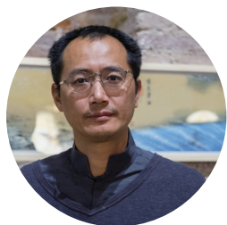
Qiu Zhijie , People's Republic of China

Qiu Zhijie is a contemporary artist, writer and a pioneer of conceptual photography and video. The central quest of his art is how creative work can intervene in daily life and achieve a new union between art, life, technology and social practice. His project Mappa Mundi illustrates this by proposing an alternative representation and understanding of existing systems in relation to each other. As a result, he has also collaborated with art institutions and companies to design system maps and with technology companies on artificial intelligence for arts and technology.